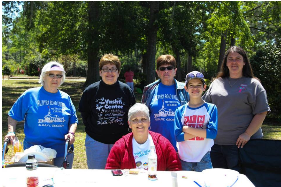
Members of Palmyra United Methodist Church Albany enjoying the afternoon.