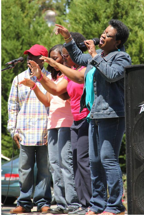
Members of the Moving Forward Concert Choir.